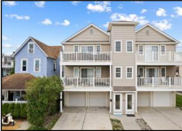
224 Magnolia Wildwood, NJ 08260