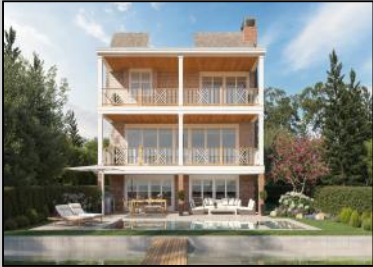
10624 Corinthian Stone Harbor, NJ 08247