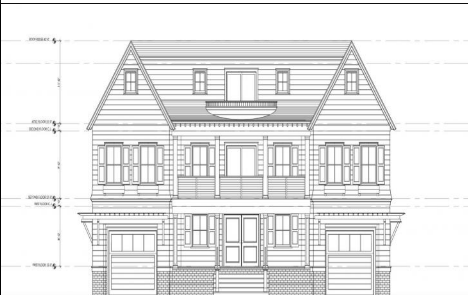
FRONT (5TH AVE) ELEVATION 1 scale: 1/4" = 1'-0"