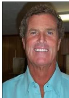
Central Air Condition