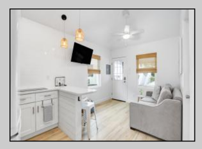
213 Heather Wildwood Crest, NJ 08260