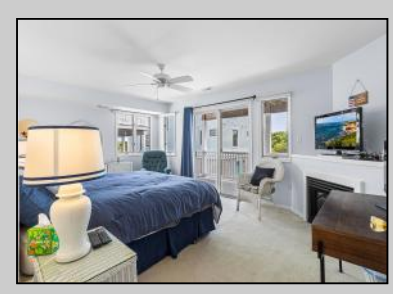
2709 Landis Sea Isle City, NJ 08243