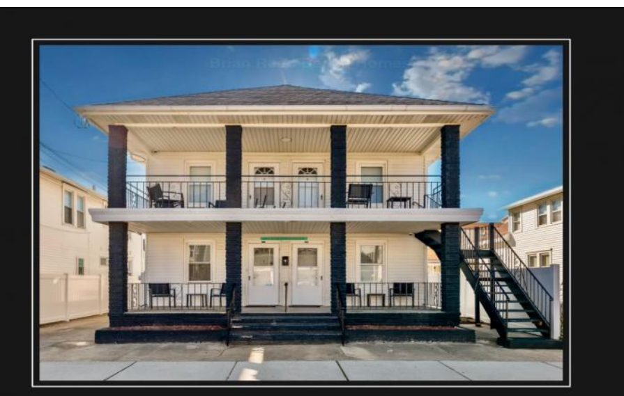
238 E LEAMING WILDWOOD, NJ 6 Unit Apartment all with 2 Bedroom