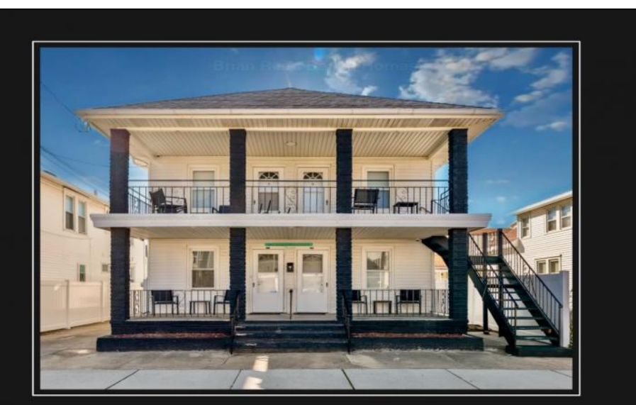
238 E LEAMING WILDWOOD, NJ 6 Unit Apartment all with 2 Bedroom