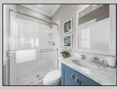
243 110th Stone Harbor, NJ 08247