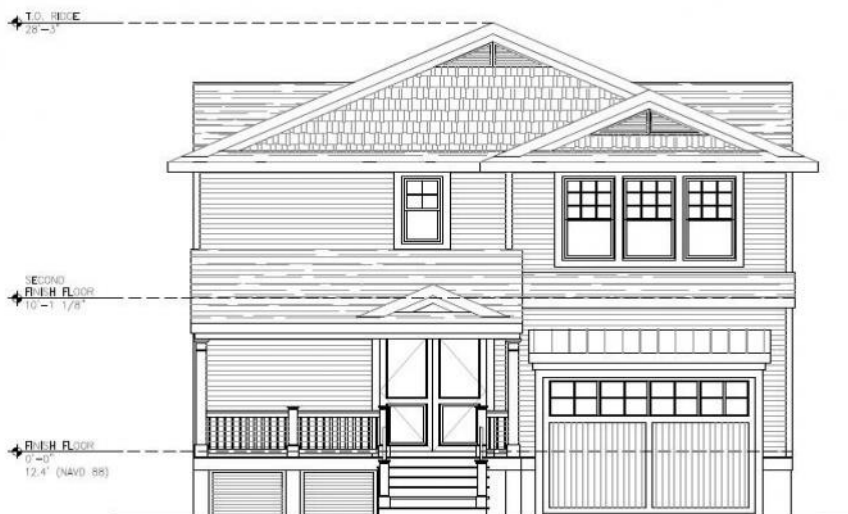
1 FRONT ELEVATION A4.1

3/32"=1'-0" (DWG SIZE 11"x17") 3/16"=1'-0" (DWG SIZE 24"x36")