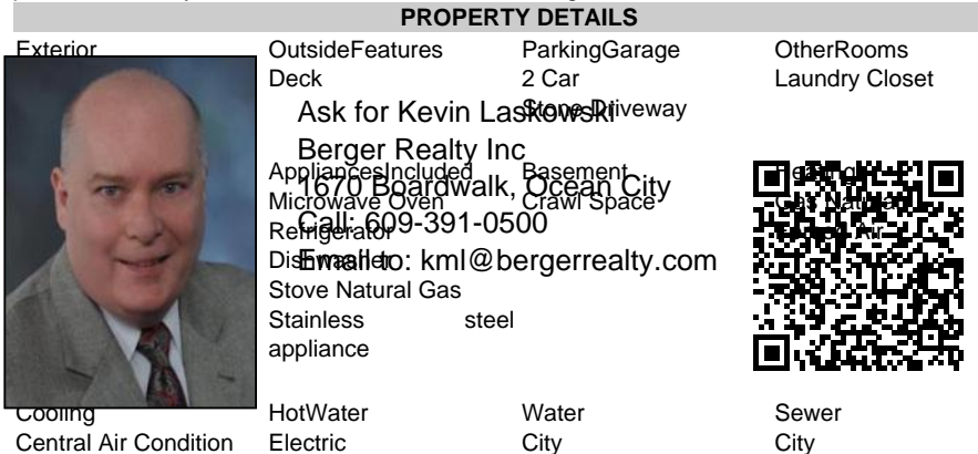
Central Air Condition