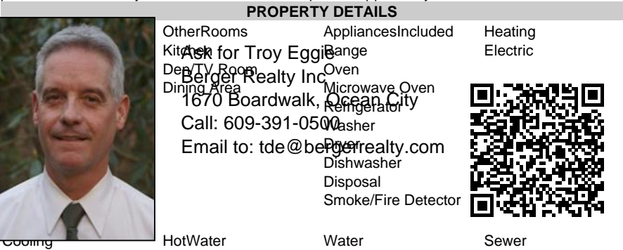
Central Air Ceiling Fan