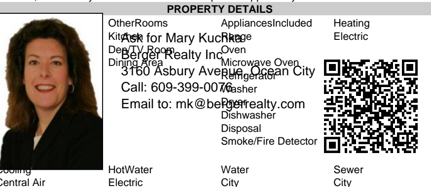
Central Air Ceiling Fan