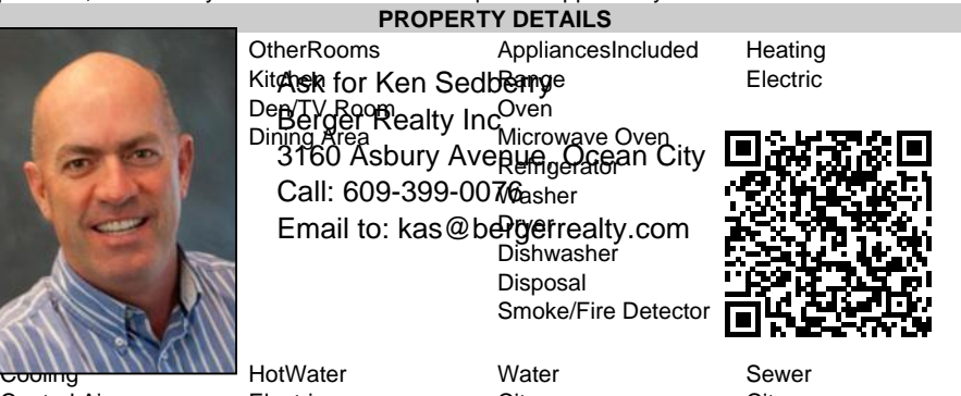
Central Air Ceiling Fan