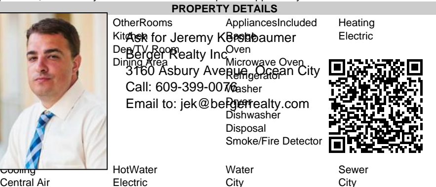
Central Air Ceiling Fan