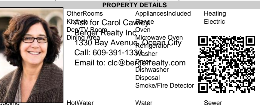
Central Air Ceiling Fan