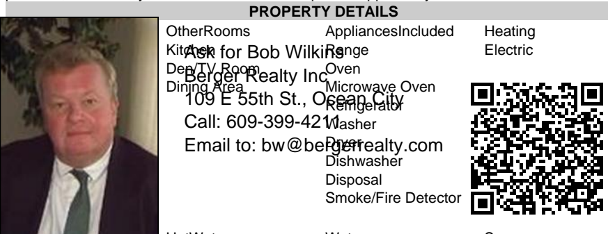
Central Air Ceiling Fan