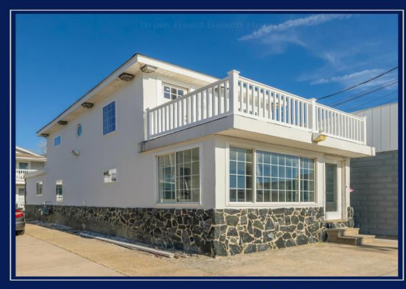
123 E Lincoln Avenue Wildwood, NJ 3 Bedroom 2 Bath Single Family