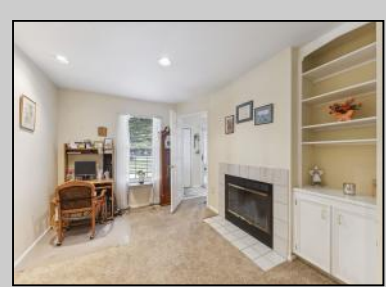
550 Central Linwood, NJ 08221