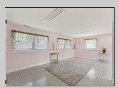
1500 Franklin North Cape May, NJ 08204