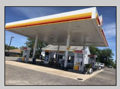
795 Route 109 Lower Township, NJ 08204