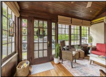
710 Corgie Cape May, NJ 08204