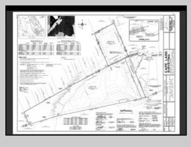
27 Woodside Dennisville, NJ 08214