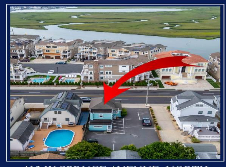
413 W SPRUCE AVENUE, NORTH WILDWOOD Commercial and Residential Property with 7 car parking