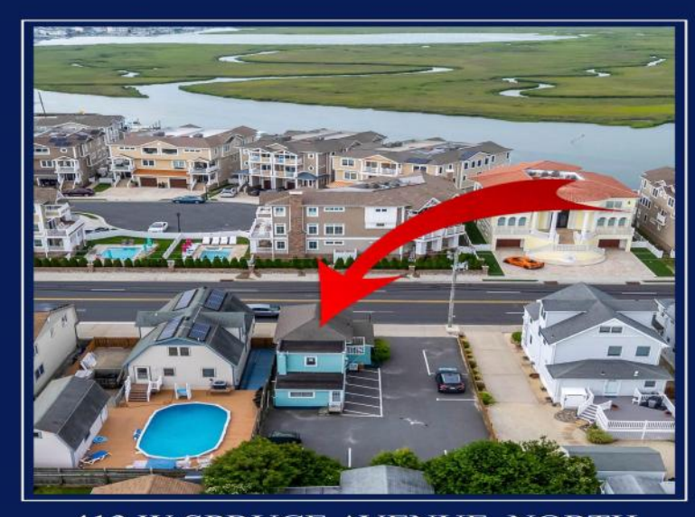
413 W SPRUCE AVENUE, NORTH WILDWOOD Commercial and Residential Property with 7 car parking