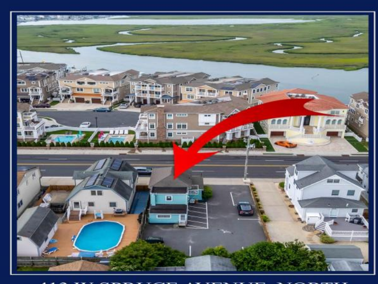
413 W SPRUCE AVENUE, NORTH WILDWOOD Commercial and Residential Property with 7 car parking