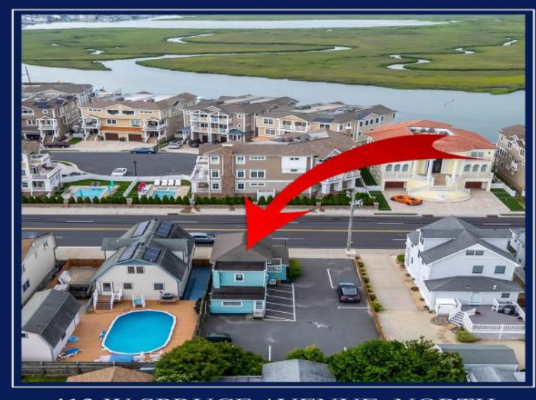
413 W SPRUCE AVENUE, NORTH WILDWOOD Commercial and Residential Property with 7 car parking