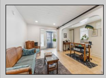
413 Spruce North Wildwood, NJ 08260