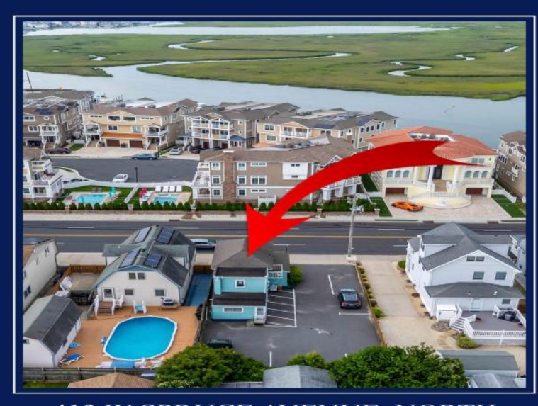
413 W SPRUCE AVENUE, NORTH WILDWOOD Commercial and Residential Property with 7 car parking