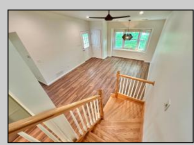
1320 Wisconsin Cape May, NJ 08204