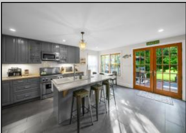
828 Corgie Cape May, NJ 08204