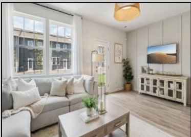
208 Bentz Villas, NJ 08251