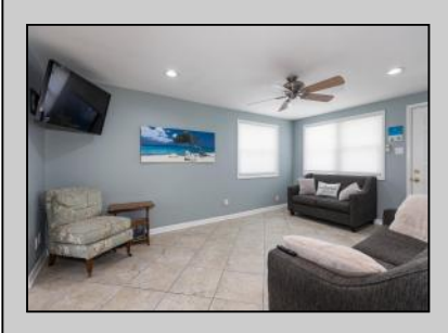
417 Monterey Wildwood Crest, NJ 08260