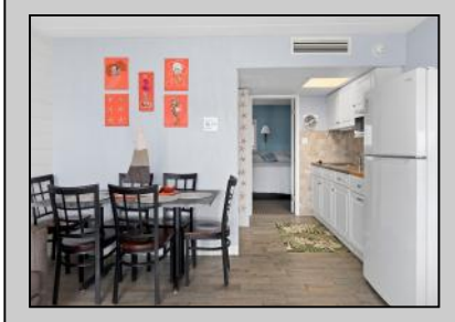
9103 Atlantic Wildwood Crest, NJ 08260