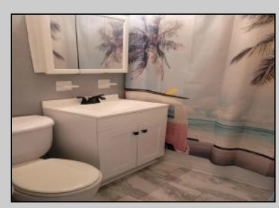
327 Maple Wildwood, NJ 08260