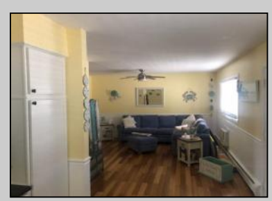
5301 Hudson Wildwood, NJ 08260