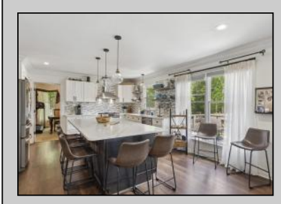
416 Hand Cape May Court House, NJ 08210