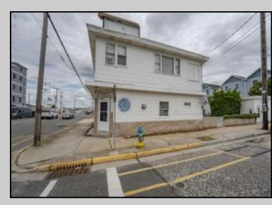
4517 Park Wildwood, NJ 08260