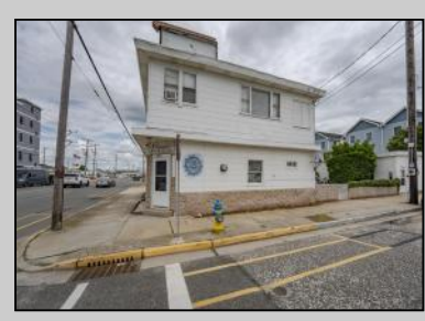
4517 Park Wildwood, NJ 08260