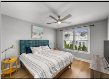
1005 Dune Avalon, NJ 08202