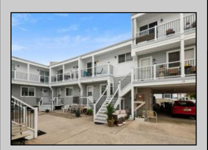
309 Surf North Wildwood, NJ 08260