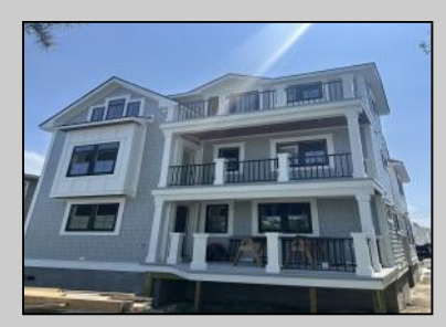
127 Hollywood Wildwood Crest, NJ 08260