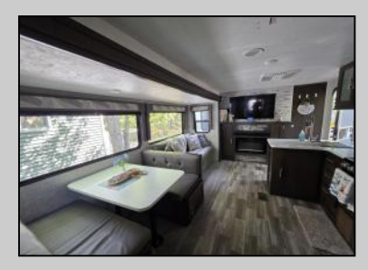
516 Route 9 Marmora, NJ 08223