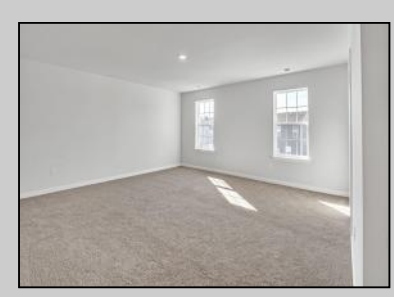
12 Winchester Seaville, NJ 08230