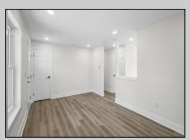
101 Roosevelt Del Haven, NJ 08251