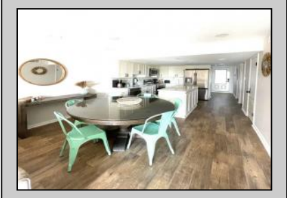
300 Raleigh Ave Wildwood Crest, NJ 08260