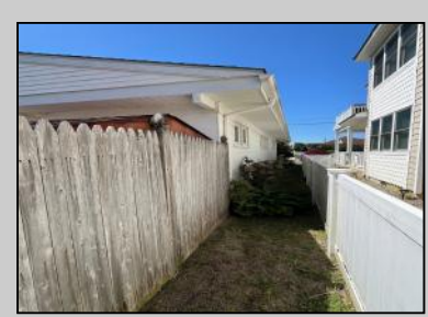
305 Saint Paul Wildwood Crest, NJ 08260