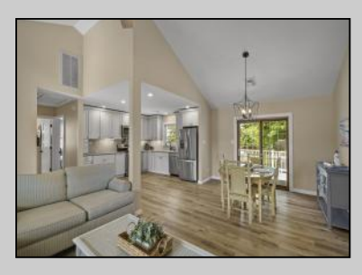
19 Beechwood Villas, NJ 08251