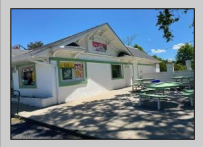
780 Route 47 South Dennis, NJ 08210