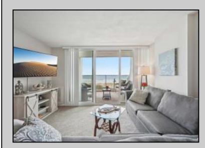
3700 Boardwalk Sea Isle City, NJ 08243